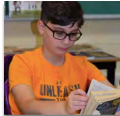
Reading and Writing