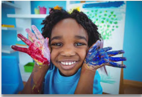
Art, Dance Drama