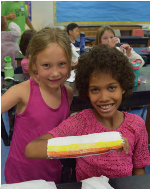
Little Vet School Little Medical School