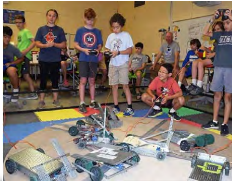
Vex Battle Bots