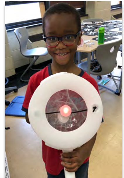
Nutty STEAM Exploration