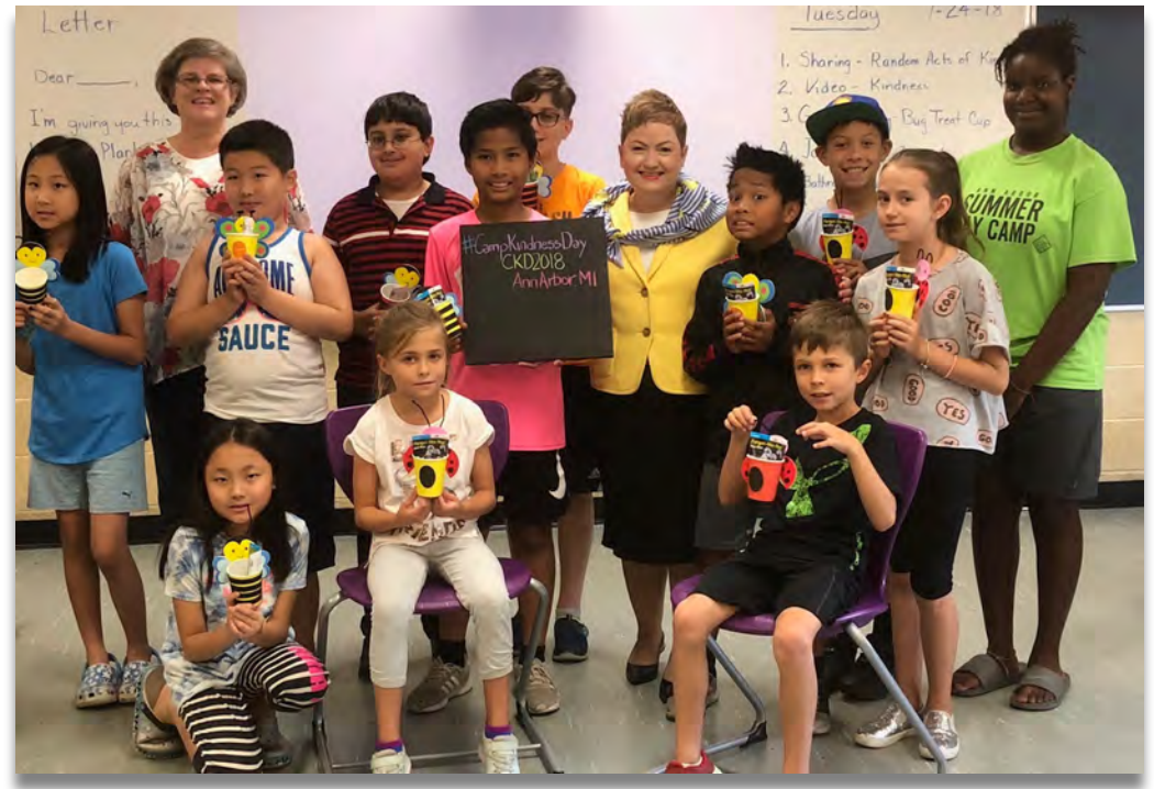
2018 Camp Kindness Day